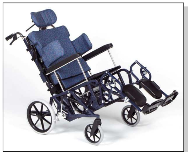
The Tilt & Fold Wheelchair fitted with Thoracic Backboard and Elevating Leg Rests.

Various Height & Width Armrest Options We also have the facilities to manufacture bespoke items as required.