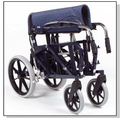
The Tilt & Fold Wheelchair Folded.

The push handles are height adjustable and reversible for the attendant's comfort and ease of use.