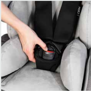
5-point harness with HERO technology