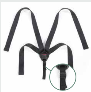
Belt extension (+ 20 cm / 7.9") incl. longer crotch strap