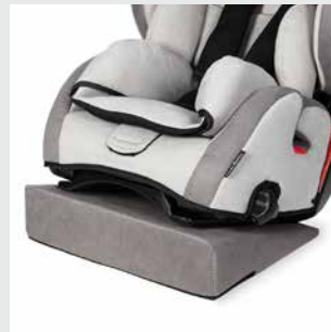
Seat wedge, below (+ 10°), max. 15° seat tilt with additional use of rest position