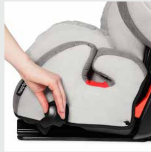
Easy and quick setting to rest position (for children of ECE group I only)