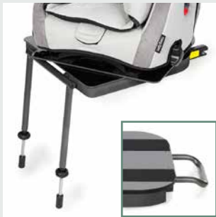
Turning plate with Seatfix connection and stand **** (detail: stabilising bow)