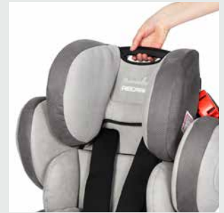
Practical carry handle