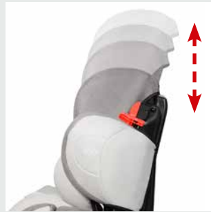
Fourfold height adjustable headrest