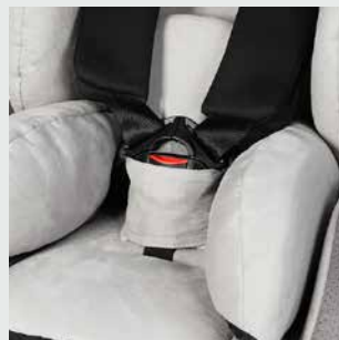
Crotch pad (large)