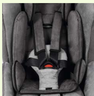
Integrated 5-point safety belt