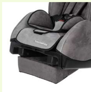
Seat wedge, below