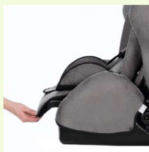
Adjustment to rest position where only seat surface and back need to be moved