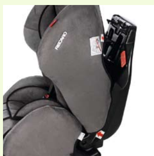
Patented quick fitting system using vehicle's 3-point belt