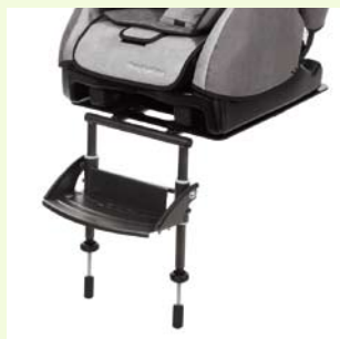
Footrest with footrest adapter